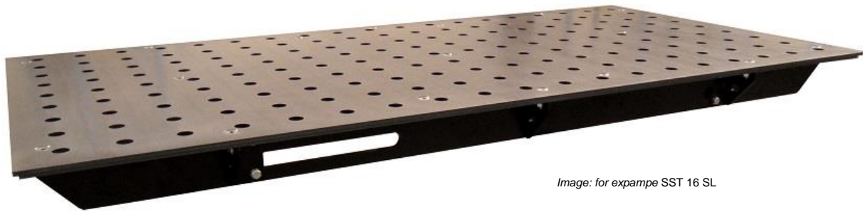
Image: for expampe SST 16 SL