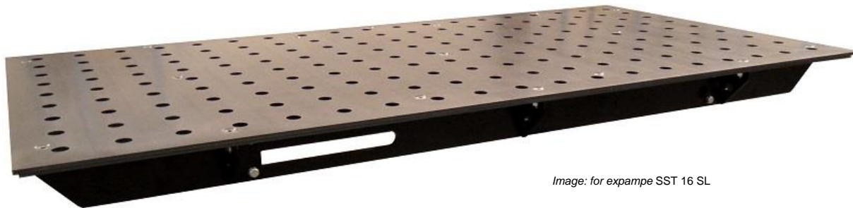
Image: for expampe SST 16 SL