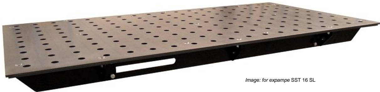
Image: for expampe SST 16 SL