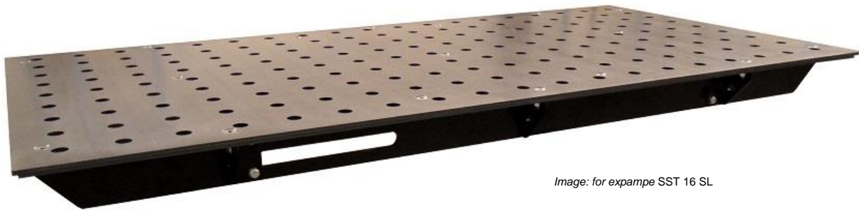
Image: for expampe SST 16 SL