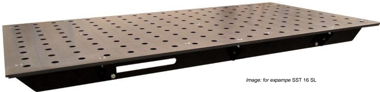
Image: for expampe SST 16 SL