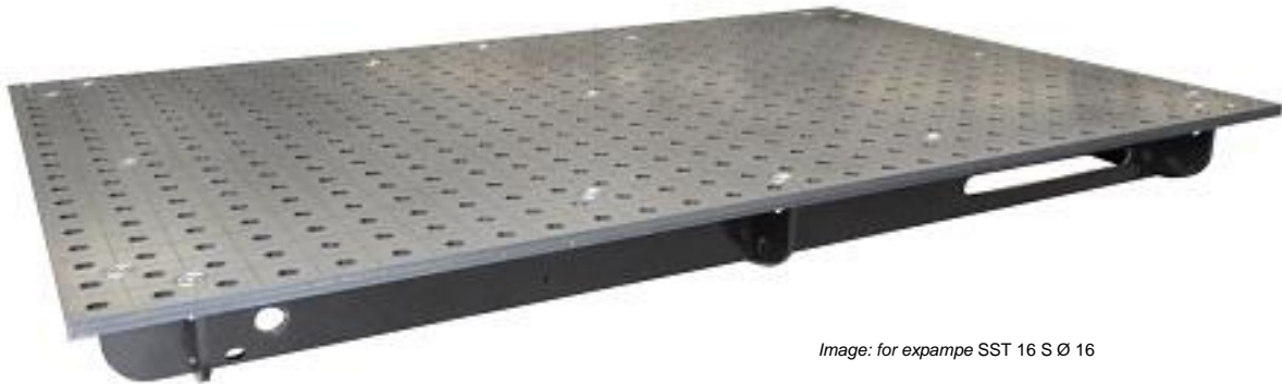
Image: for expampe SST 16 S Ø 16