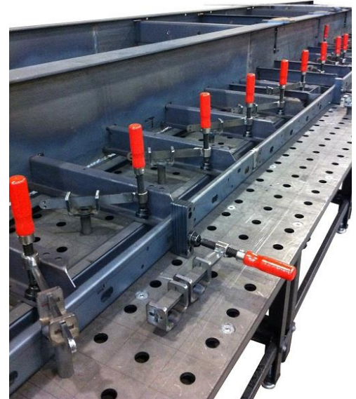
Images: Examples of use for clamps