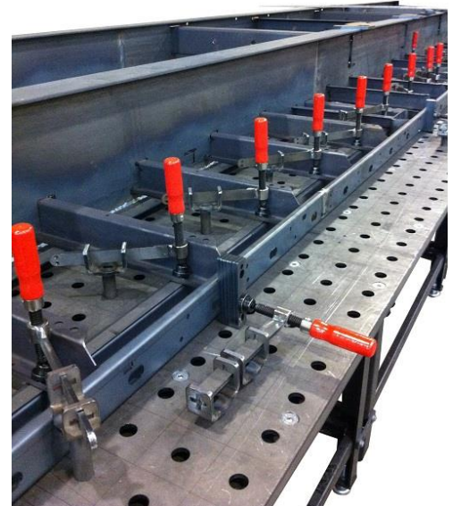
Images: Examples of use for clamps